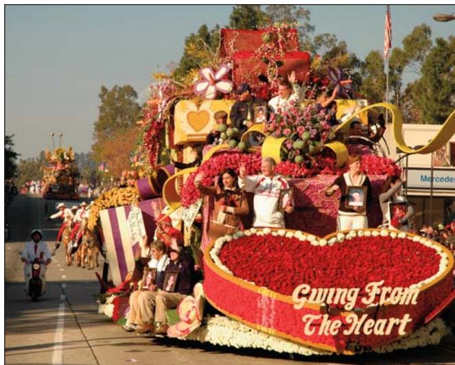
The Donate Life float makes its way down Pasadena Boulevard.