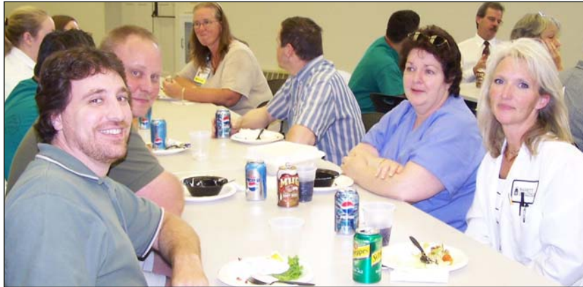
Staff from Bassett Healthcare in Cooperstown enjoy a lunch hosted by CDT in appreciation of their support on recent DCD cases.