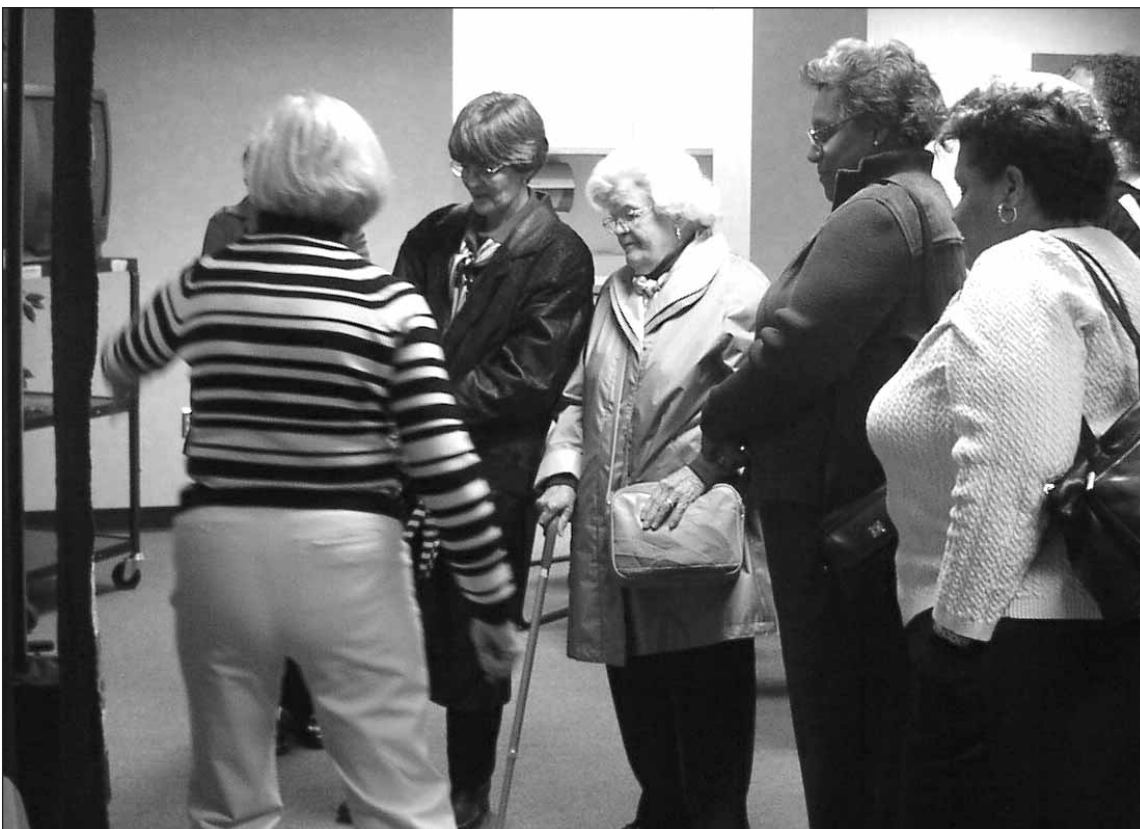
Donor family members who contributed a patch view CDT's "Kaleidoscope of Memories" quilt at a reception on March 21st.