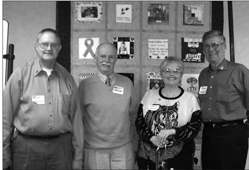
CDT volunteers pose at a training session presented by Transplant Speakers International. TSI offers seminars on sharing personal stories related to donation and transplantation and soliciting speaking engagements from the community.